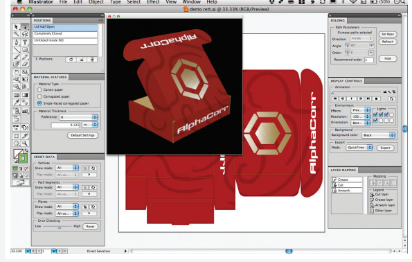
Create a 3D image based on Illustrator artwork and the cut or fold lines in FoldUp!3D.

FoldUp!3D supports both Mac and Windows platforms, including Mac OS OS X, Windows 7, Vista or XP.